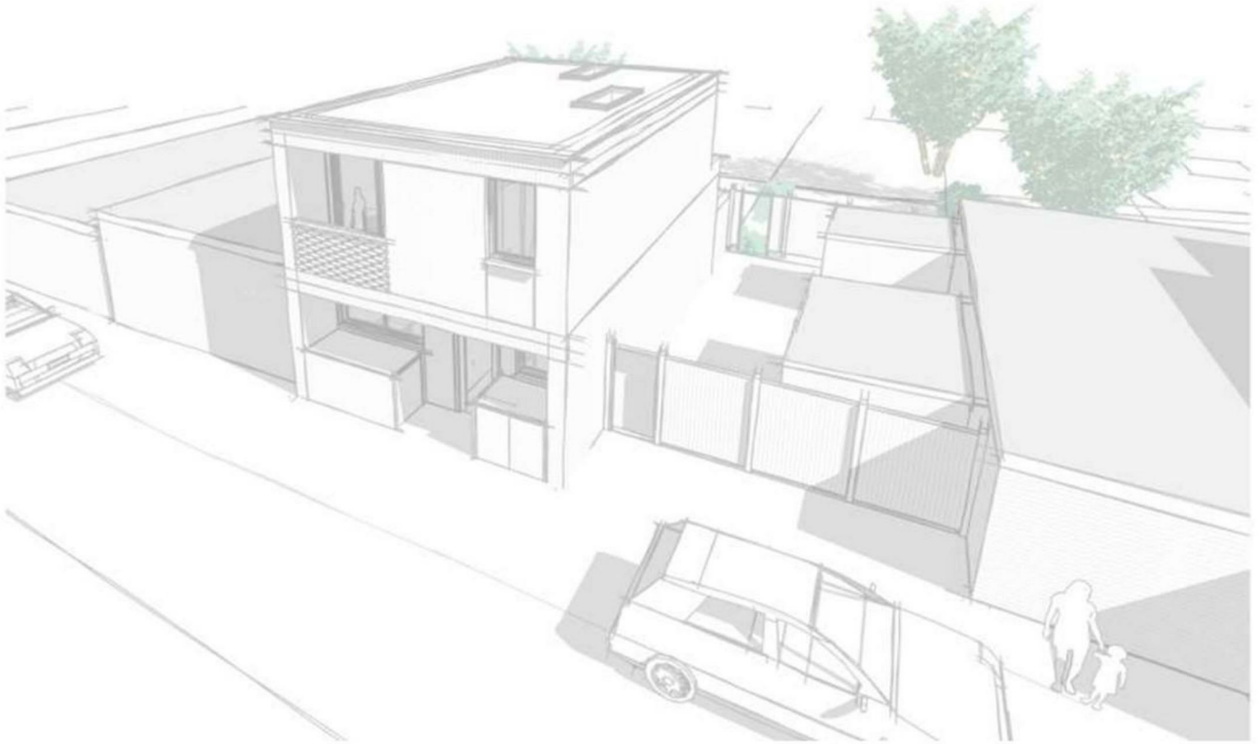
5.4. Front - Aerial 3D view